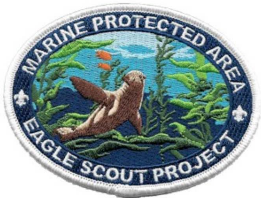
FIG. 1-22 MARINE AREA EAGLE PROJECT 4x3